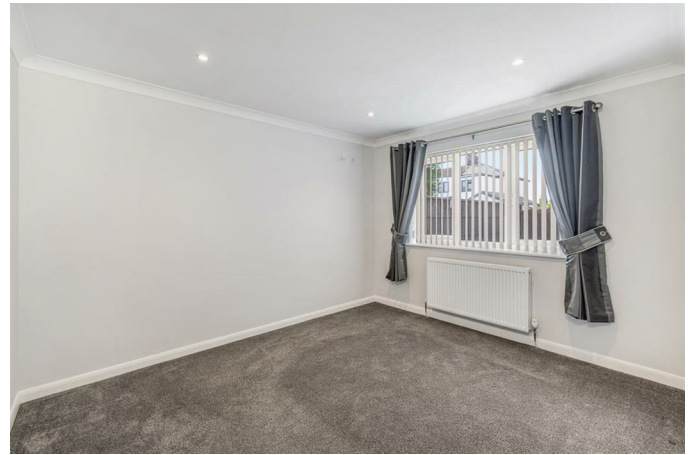
Bedroom 2 11'9" x 10'1" (3.60m x 3.08m)

PVC double glazed window to front. Coving to skimmed ceiling with recessed spot lighting. Radiator.