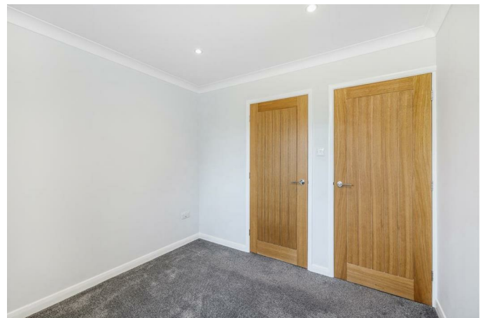
Bedroom 3 8'5" x 9'0" (2.58m x 2.76m)

PVC double glazed window to rear. Coving to skimmed ceiling with recessed spot lighting. Radiator. Built in cupboard.